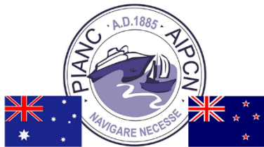
PIANC Australia & New Zealand

Some of our National Sections or national divisions have news to share on their past and upcoming activities. Please click on the country logo for some local news from our PIANC National Sections!