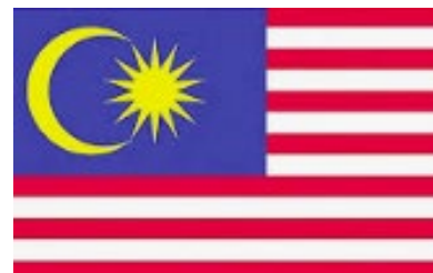
PIANC in Malaysia