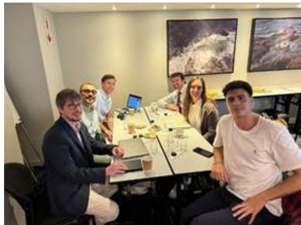
Clockwise: Europe-Africa 1, Europe-Africa 2-online, Americas, AsiaPacific